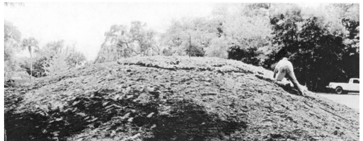
Planting sod on the surface of a restored mound.

Vegetation is fundamental in erosion control. Often when vegetation is well established and undisturbed, the ground surface is stable and erosion is absent. If the ground cover has been removed and soil is exposed, erosion is more likely, especially on slopes. Flowing water will concentrate in areas of least resistance, on bare soil rather than through leaves, stems, roots, and humus. As the loose soil is washed away, the flow is further concentrated.