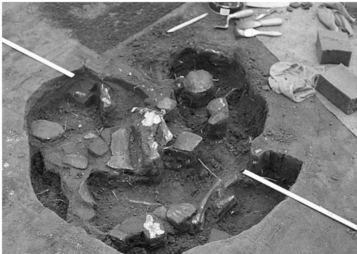
Archaeological feature being excavated with pit contents (potsherds, mica, turtle and deer bone, etc.) left in place to document their context.

The single most important characteristic of archaeological sites is association , that is, the relationship between all of its components. Artifacts and other cultural remains that are associated together represent single activities or events that can be revealed through careful excavation and analysis. When artifacts and remains that are from separate time periods or separate events are mixed together, it is difficult or impossible to recreate what happened at the site. This simple fact leads to the most basic principle of archaeological site management. Things should remain