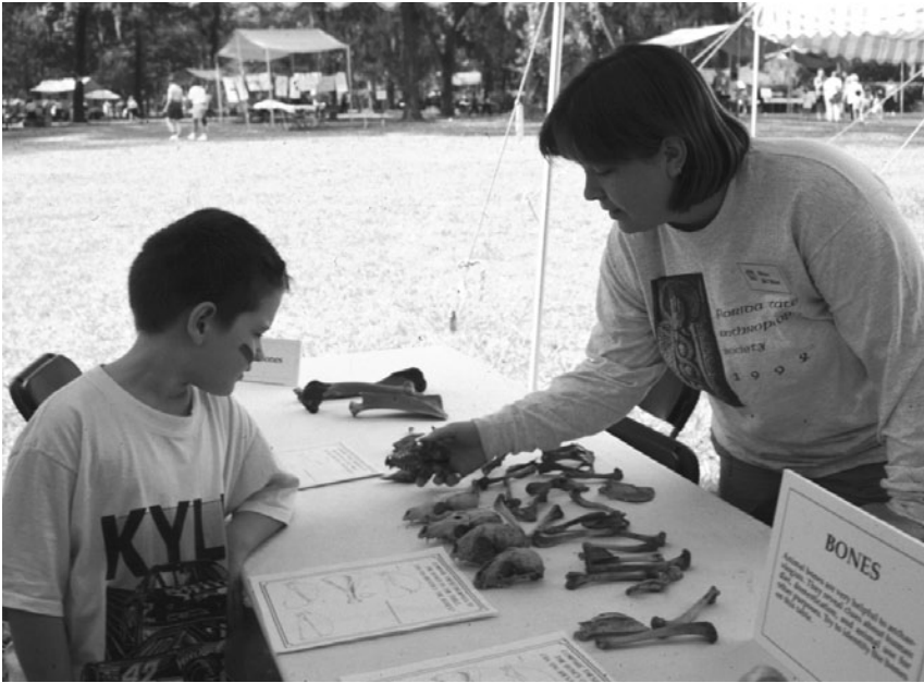
An archaeologist identifies, for a young onlooker, animal bones recovered from an archaeological site.

since they are protected by the topsoil and humus layers. Many sites are naturally vegetated with trees, shrubs, and ground cover. While tree roots extend through archaeological deposits, their disturbance can usually be sorted out during excavations. The most important part of the vegetative association is ground cover. Where ground cover is missing or not healthy there is a greater risk of erosion, especially on slopes. Ground cover should be repaired or reestablished if exposed soil is unstable.