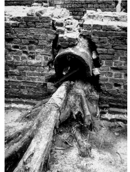
An example of the kind of destruction to archaeological and historical remains caused by tree growth.

Trees, while normally excellent erosion deterrents, can damage a site. When an old tree is blown over, a large root ball is sometimes pulled up, which displaces the dirt and any artifacts that might be in it. Trees located on an archaeological site should be examined routinely for signs of death and disease. Sick trees should be cut off close to the ground, leaving the roots to rot in place. This prevents tree falls and ensures that no further disturbance is done to the site. Consult with a local arborist to determine the best course of action.