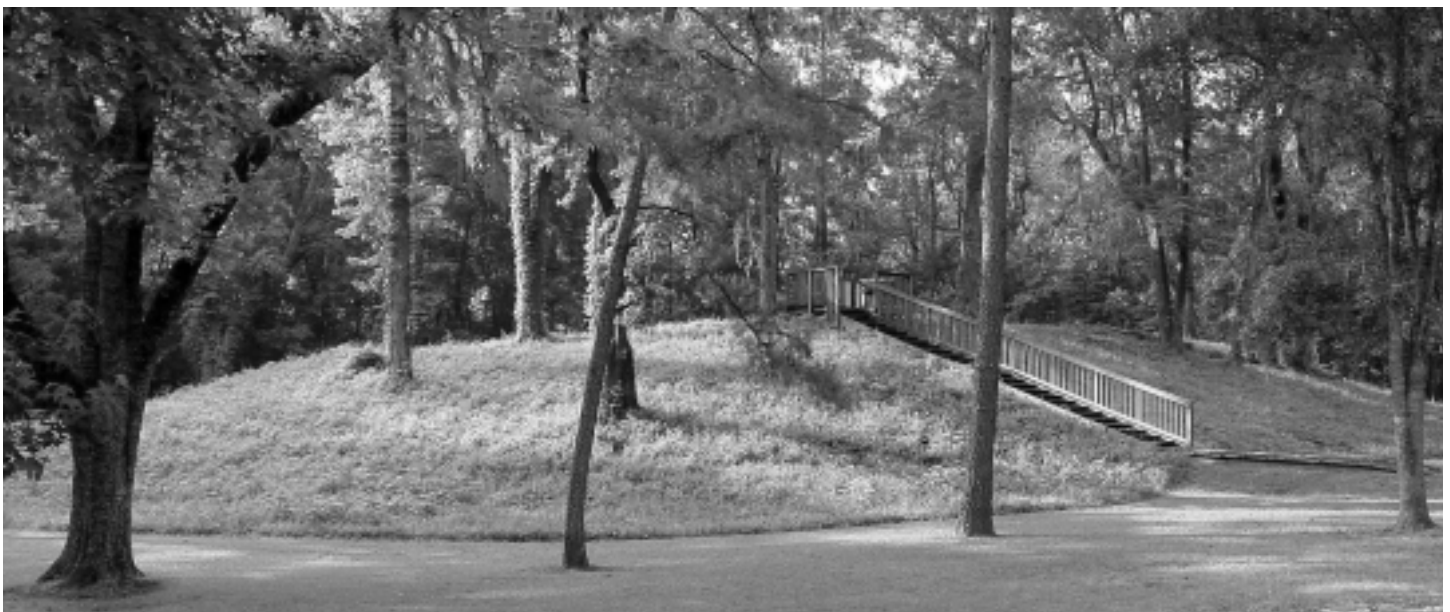
Lake Jackson Indian temple mound, Tallahassee, ca., AD 1000-1500.