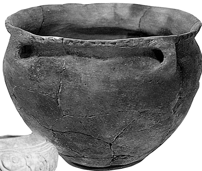
Below: Cazuela-shaped ceramic vessel dating back to A.D. 1350-1500, Late Mississippian. Johnson Ceremonial Breaking site, Fort Walton Beach, Florida.