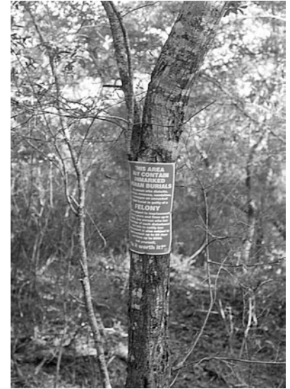
Signage warning looters against unauthorized digging and the penalties for disturbing unmarked burials.

Signs are typically one component of a broader site protection program that includes law enforcement and regular site monitoring. Two types of signs are helpful. The first type guides or interprets; the second advises or warns. Signs that guide or interpret are used to direct, such as trail markers, or to educate, such as historic plaques. The second type of sign makes the viewer aware of the law and the penalty for damaging or endangering a site. Experience has shown that the use of signs generally, but not always, reduces site looting and vandalism. Like a lock, signs keep honest people honest. Signs usually should not be posted at archaeological sites located in remote areas, as they might call attention to sites that cannot be properly protected. On the other hand, highly visible and accessible sites should have prominent signs that both interpret the site and discourage damaging activity. These signs should indicate to visitors how to report unauthorized activities. Signs can also be placed along trails and roads, near campsites, and as part of a wayside exhibit.