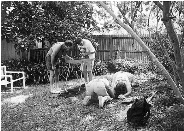
Archaeologists at work in the backyard of a home. A screen is employed to help recover small excavated artifacts.

Having identified the extent and significance of the site and determined that protection is warranted, development should proceed in a fashion that has the least amount of adverse impact to the site. Ground disturbing activities such as the installation of an in-ground pool, septic tank and drainfield, electrical cable, water pipes, or a building foundation should be planned in areas without archaeological remains. There are many appropriate above ground uses of archaeological sites that also serve as a means of protecting them. Landscaping, which can minimize or avoid ground disturbance by using fill or other means is the most obvious. It can also serve to preserve the open space setting of the site. Sites may also be protected by carefully sealing them under properly designed driveways, parking lots, tennis courts, or the like.