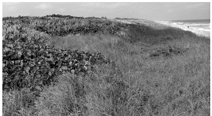
An example of a healthy, well-vegetated sand dune.

Vegetation Hay Bales Breakwaters Re-nourishment