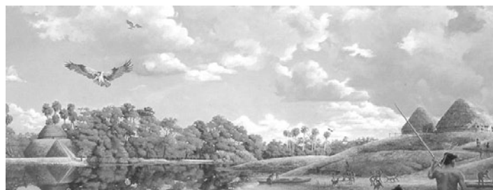
Artist's impression of a Timucuan village located along the St. Johns River, ca., 1450. This scene was modeled after research findings from the Thursby Mound and Hontoon Island, two neighboring archaeological sites.

Archaeological sites are surprisingly common on the landscape and come in all sizes and a variety of types. Archaeological sites in Florida range from large, prominent prehistoric mounds, historic forts and plantations, to smaller sites, such as a historic dump or small scatters of artifacts that represent temporary encampments of Native American people. Regardless of size or complexity, all archaeological sites have the potential to tell us something about people and environments of the past. More than 27,000 different archaeological sites of all periods are already known in