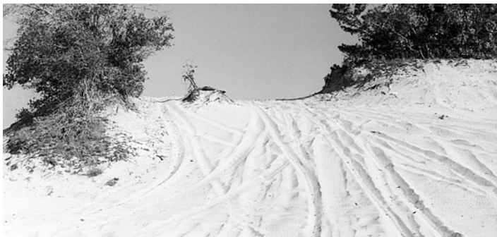
Off road vehicle activity can be very destructive to archaeological sites.

Off road vehicles (ORVs), horses, bikes, and frequent pedestrian traffic can damage archaeological sites. Many parts of archaeological sites are very fragile. In addition to crushing sites and artifacts, ORVs can damage vegetation, contributing to subsequent water and windblown sand erosion. To a lesser extent, horseback riding, bikes, and pedestrian traffic also create erosion