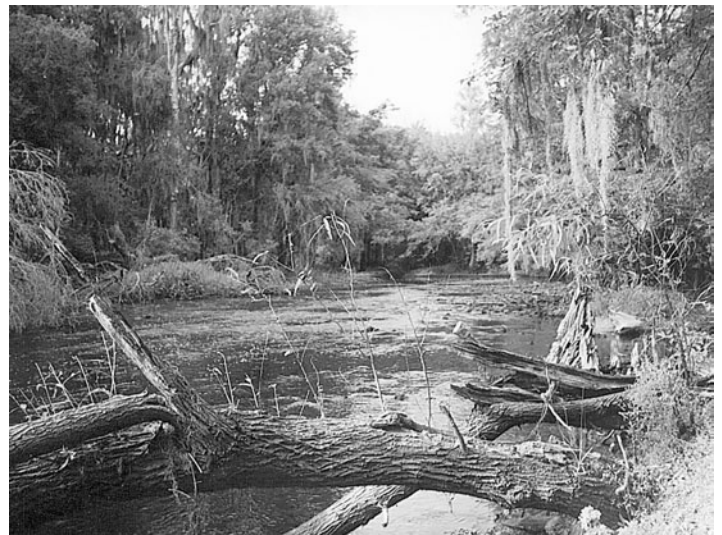
Example of river erosion causing tree fall, exacerbating erosion until the obstruction is removed.

Stream erosion includes many kinds of events, from sheet flow across normally dry lands, to lakeside erosion due to changes in water level, to bank erosion in the largest rivers. Stream erosion occurs most frequently when there is some change in the normal equilibrium of a flow of water in its normal course. Erosion might be due to altered vegetation within, along, or near a stream,