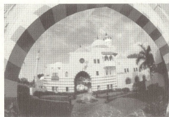
Opa-locka City Hall is an example of the Moorish Revival style utilized by the African American community of Opa-locka in northwest Miami to celebrate their unique heritage. It is one of many historically significant Florida sites included as part of Florida's Black Heritage Trail.

Historic buildings can be featured as exhibits in museums, visitor centers, libraries, and other public places. They include not only text and graphics, but also objects related to the buildings or the families that have lived in them.