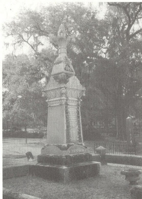
Historic grave markers are an interesting facet of Tallahassee history that can be visited at the Old City Cemetery, or found on line at the site's web page.

Interpretation of historic buildings on the internet offers great opportunities for public access without visitation. The multimedia capabilities of the Internet allow text, photographs, video, and even sound to be available to millions of people. Many Internet sites