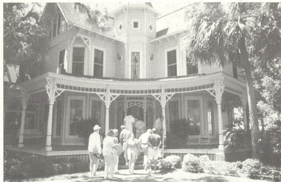
This historic home in Tarpon Springs is periodically opened to the public.

Providing public access to historic sites adds character and interest to our towns and cities. Such sites contribute to economic vitality, civic pride, and revitalization of older town centers, as well as providing many other public benefits. Most important, they provide a link between the present and the past, a way to understand how things came to be, and a chance to consider how we would like our communities to grow in the future. For property owners, providing public access can contribute to an appreciation of a community's heritage, can support local tourism, and can even provide tax benefits for sites listed on the Nation Register of Historic Places.