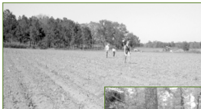
Top: While surveying Foshalee Plantation conservation easement near Tallahassee, State of Florida archaeologists locate artifacts and use Global Positioning System (GPS) to map the location of artifacts.

This type of easement protects the open space or scenic vista associated with a historic structure to preserve its historic character. Open space or scenic easements are also commonly used to protect archaeological sites,