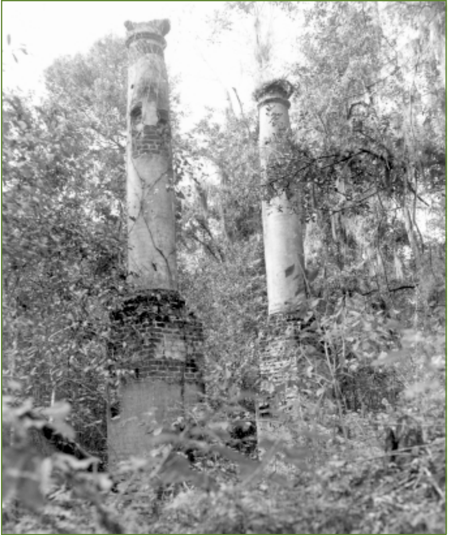
Archaeological remains of Verdura, a plantation home in Leon County, Florida. A few classically styled pillars are still standing.

1997 Historic Preservation Easements: A Historic Preservation Tool with Federal Tax Benefits. National Park Service, Washington, D.C.