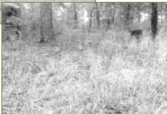
Above: A cemetery is recorded while surveying Foshalee.

particularly in cases where an archaeological site cannot qualify for a historic preservation easement under the IRS code.