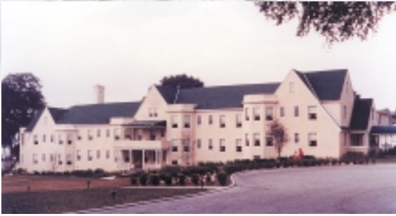
Lakeside Inn, located in Mt. Dora, Florida, is one of several historic structures the Florida Trust for Historic Preservation holds under easement.

For more information on protecting cultural resources in Florida, like Site Stewardship, Site Watch, public access to sites, and general information about site conservation, visit our web site at www.flheritage.com/protection or contact the Florida Bureau of Archaeological Research via email at sitewatch@mail.dos.state.fl.us or by phone at (850) 487-2299.