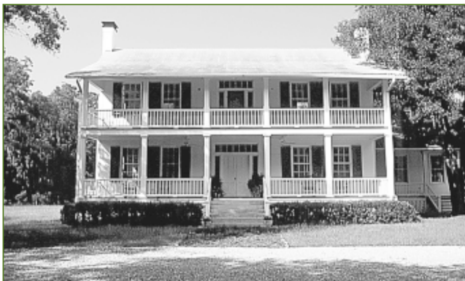
The Red Hills Conservation Program protects the Bannerman house, near Tallahassee, Florida under an exterior or facade easement.

Also, contact your local municipal or county government to inquire if they hold conservation easements to protect archaeological sites.