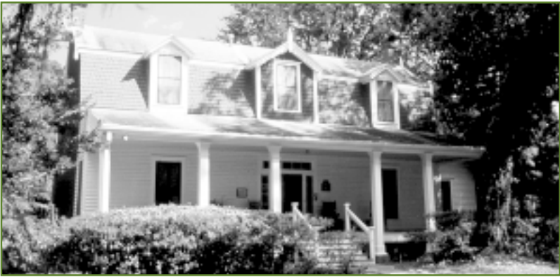
The Matheson House, in Gainesville, FL, is held under an exterior or facade easement by the Florida Trust for Historic Preservation.

This type of easement protects the outside appearance of a building. Usually it restricts alterations or additions to a structure that may harm its integrity and historic character.