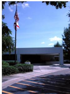
State Records Center

The mission of the Friends of the State Library and Archives of Florida is to enrich library, archives, and records management services for the benefit of Florida's residents by promoting and supporting the programs and services of the State Library and Archives of Florida.