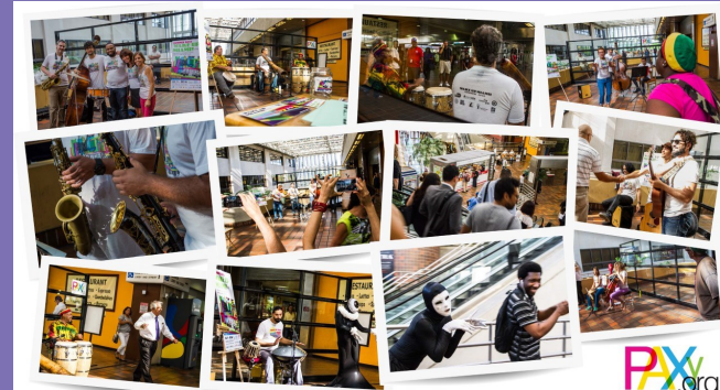
2017 Diversity and Inclusion Award Winners included Miami's PAXy

The Awards program is two-fold; recipients will receive a monetary award to reinvest in the initiative or program recognized and also receive recognition and visibility through the following Department efforts: