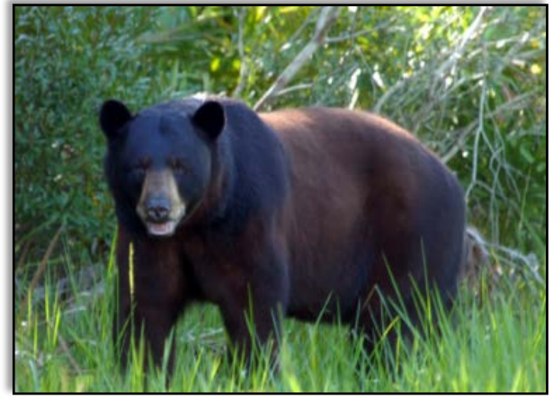
Florida Black Bear ( Ursus americanus floridanus ) Native endangered species