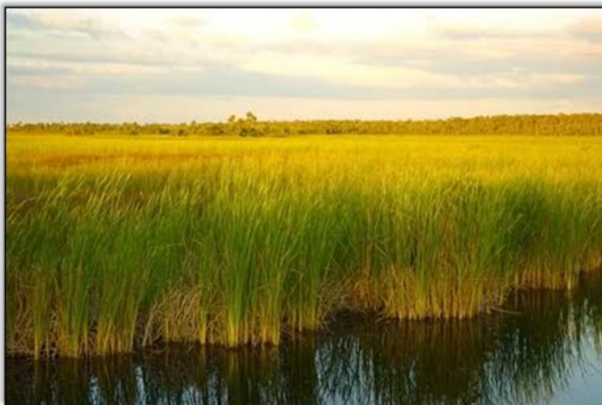
Everglades (The River of Grass)