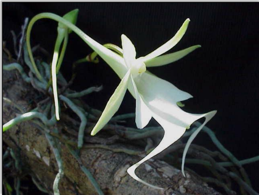
Ghost Orchid ( Dendrophylax lindenii ) Endangered species - native to the Everglades and other South Florida wetlands

Failure to complete the proper environmental review could result in delays or jeopardize federal funding. If the project is implemented before NEPA review has been completed, funding may be denied. No funds for project costs will be released until the environmental review is complete and the project has been obligated by FEMA.