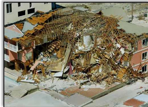
Pensacola Beach Debris Hurricane Ivan

For more information on debris, please see Appendix D .