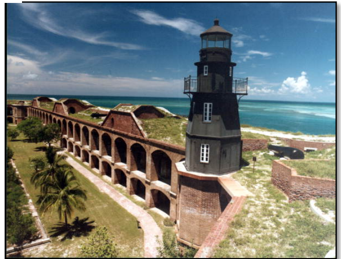
Fort Jefferson Lighthouse