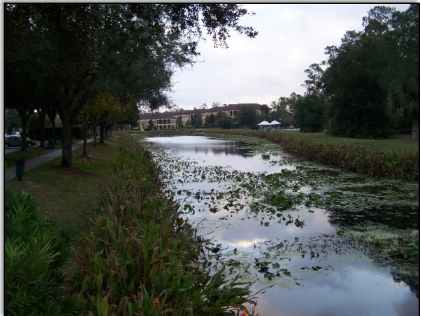
Retention Pond Celebration, FL