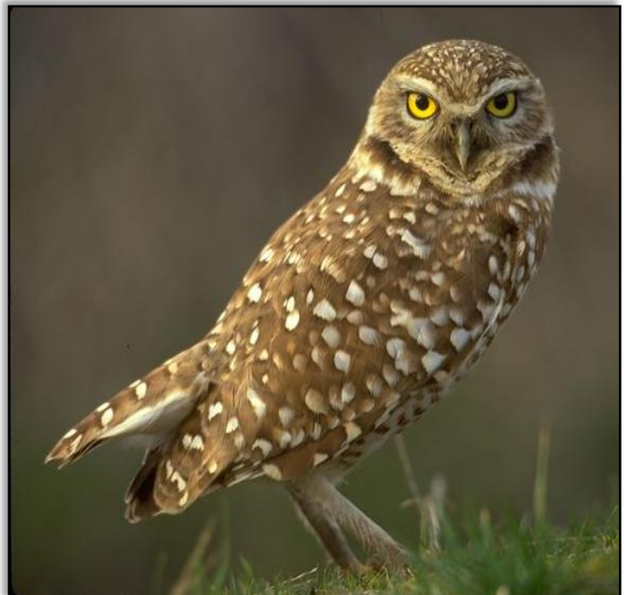
Florida Burrowing Owl ( Athene cunicularia ) Native species of "special concern"