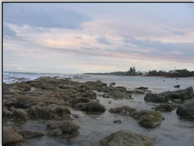
Bathtub Reef Martin County

NOTE: Keep in mind that all projects will be evaluated on a case by case basis. If a project type is not discussed here, it does not mean this type of project is ineligible for funding or exempt from environmental review. This is not a comprehensive list of projects. FDEM Environmental and Historical Preservation staff will gladly assist and answer any questions you may have.