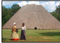
Mission San Luis