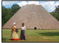
Mission San Luis