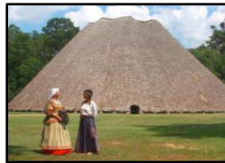
Mission San Luis